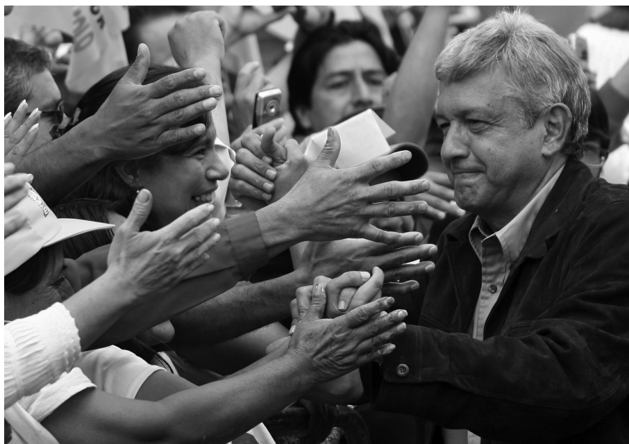
Opposite: Mexico's President, Felipe Calderón, holds up a newspaper announcing his victory. Above: Manuel López Obrador greets supporters in Mexico City before his eventual loss in the drawn-out and bitterly-contested presidential election.

The real issue in 2006 was not fraud. Serious journalists and pundits were concerned instead about equity in the campaign. Most coherent arguments attempted