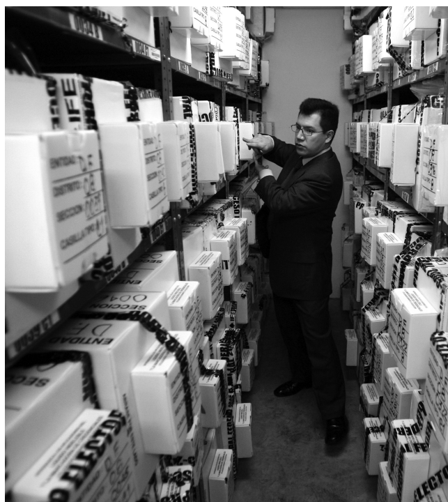
A judicial official counts boxes of votes as part of the 2006 presidential election recount. Despite Obrador’s claims and protests, no evidence of systematic fraud was found.

If and when new parties and independent candidates are welcomed into the electoral arena, the immediate reelection of elected officials must be implemented to create the link of accountability between officials and voters that has been absent in modern Mexican politics. No democracy should insulate elected officials from voters or take away voters’ abilities to punish ineffective or unresponsive policymakers and their parties the next time around at the polls. ■